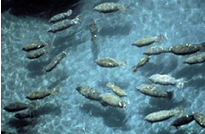
TRAPPED BY TOXINS. Manatees often can't evade brevetoxins when red-tide algae infest the warm haunts that the marine mammals need to survive during the winter.

This bloom began last January in the Gulf of Mexico off Tampa. Currents moved it to coastal inlets, bays, and the mouths of rivers, where boaters began reporting dead manatees in March. K. brevis blooms in Florida can last from 30 days to 18 months.