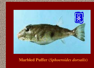
Marbled Puffer ( Sphoeroides dorsalis )