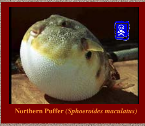
Northern Puffer ( Sphoeroides maculatus )