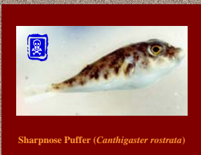
Sharpnose Puffer ( Canthigaster rostrata )