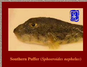
Southern Puffer ( Sphoeroides nephelus )