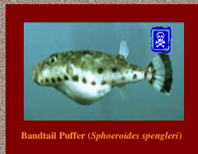
Bandtail Puffer ( Sphoeroides spengleri )