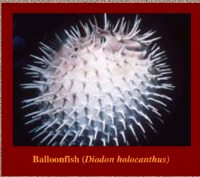
Balloonfish ( Diodon holocanthus )