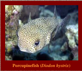
Porcupinefish ( Diodon hystrix )