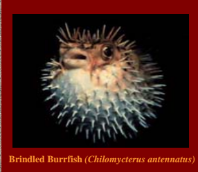
Brindled Burrfish ( Chilomycterus antennatus )