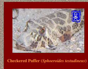
Checked Puffer ( Sphoeroides testudineus )